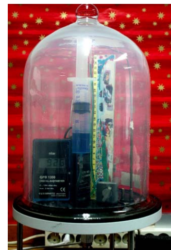
fig.4: A syringe with the tube in a vacuum jar. Additionally there is a digital barometer and thermometer inside.

A construction with a syringe (e.g. 60 ml) and a tube is even simpler (figure 3; right part). The device is simultaneously air and water-tight; you can easily calculate the air volume in the calibrated syringe and then can simply calculate the cross-section. In the example, the air volume in the syringe is V_0 = 24 \text{ cm}^3 , the cross-section A_1 = 6.2 \text{ cm}^2 and the inner cross-section of the small tube A = 0.07 \text{ cm}^2 . The whole construction can even be placed in a vacuum jar (figure 4). In this way, low and high atmospheric pressure can be simulated in the laboratory.