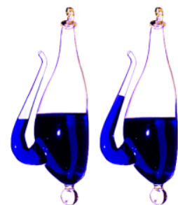
fig.2: High atmospheric pressure leads to a low water level in the spout, low pressure to a high level (at constant temperature).