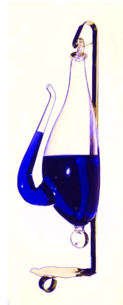
fig.1: Typical weather glass. The round-bodied vessel contains coloured water. Differences in the water level in the beak-shaped spout indicate changes in barometric pressure.

The weather glass is, however, still useful as a device which you can build easily by yourself and which can teach some applications of fundamental laws of physics.