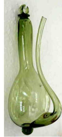
fig.6: Weather glass with an almost cylindrical spout (with permission from [1]).

A height of 10 m corresponds to a pressure of p = 998,75 \text{ hPa} . If you walk up or down four floors of a building (about 10 m) with a very sensitive weather glass ( 1 \text{ cm} \cong 1 \text{ hPa} ), the difference in the water levels should be about 1.25 cm, with constant temperature assumed! This is relatively sensitive. Most commercial weather glasses are not appropriate for this experiment since they show only level differences of about 0.1 cm. A trip in an elevator in a skyscraper would be much more impressive but remember to keep temperature constant, which is not always possible.